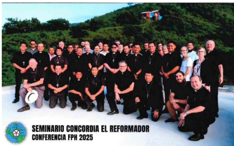
SEMINARIO CONCORDIA EL REFORMADOR CONFERENCIA FPH 2025