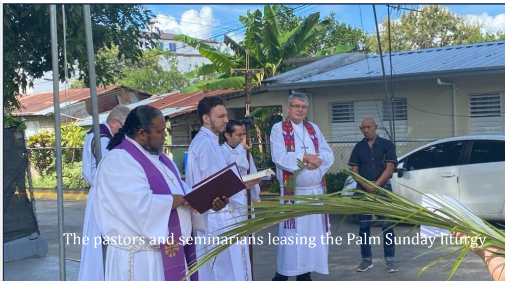
The pastors and seminarians leasing the Palm Sunday liturgy

To support our work financially, you may send a tax-deductible gift to: