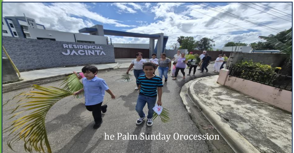
the Palm Sunday Procession

After the celebration of Easter Sunday, the seminary will get back to its regular schedule. The semester will finish up on the 15 th of May. Remember our seminarians in your prayers as they finish up their assignments and prepare for their final exams.