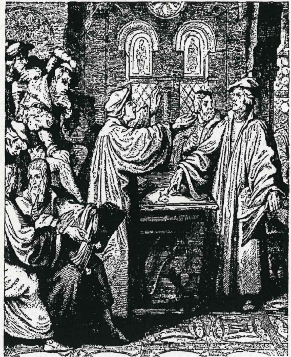
Luther and Zwingli debating at the Marburg Colloquy.