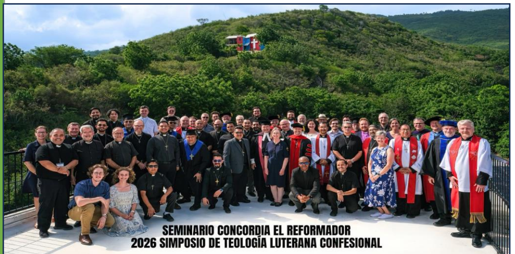
SEMINARIO CONCORDIA EL REFORMADOR 2026 SIMPOSIO DE TEOLOGIA LUTERANA CONFESIONAL

The seminary fall academic semester will get underway on the 16 th of September. During the month of July the remaining seminarians will take some intensive courses during the month of July. They will continue to assist the pastors in the local congregations.